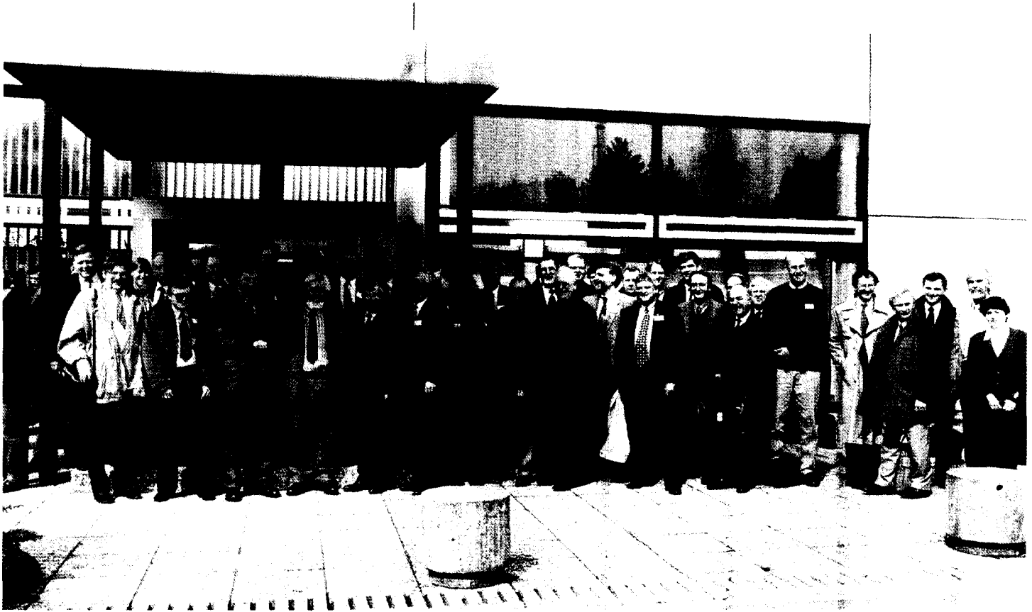
Max Planck Institut, Göttingen, 09.04.1997