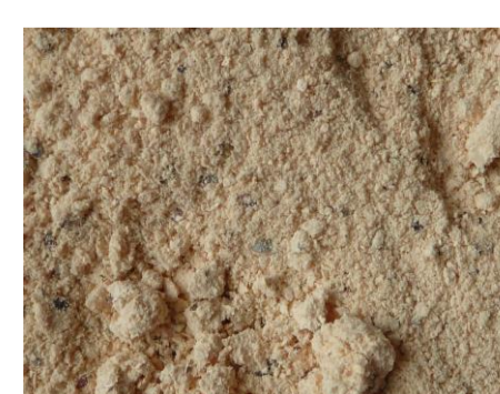
Figure 4 : Meal aspect

Improved value of oil and meal: The ethanol process reduces the oil acidity and refining costs resulting in a slightly better oil value (+1.1%). Dehulling and ethanol extraction are contributing to increase the proteins concentration of the meal, dehulling by removing fibers, ethanol by extracting sugars and phenolic compounds. Mild desolventization preserves the proteins digestibility and gives a pale yellow color to the meal (fig. 4). These better characteristics and an "hexane-free" claim will strongly improve the value of the meal (+ 60%). Hulls contain fibers and 15% of proteins that could be used as feed for cattle (value ~10% above wheat straw).