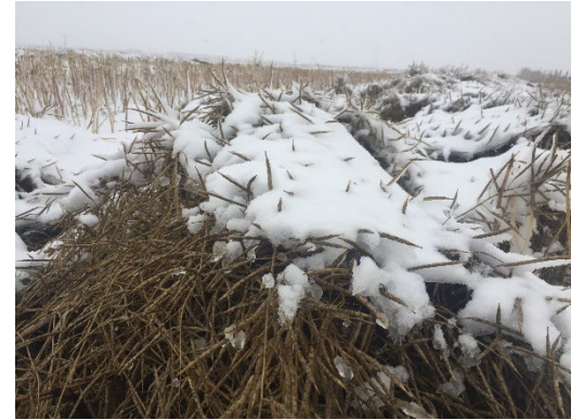
Canola Council of Canada