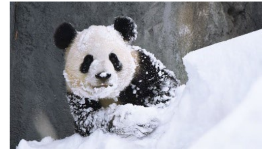
Calgary Zoo – CTV News