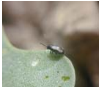
Fig.3: Adult of Phyllotreta.nemorum

Since 1998 cause the pest economic damages also in autumn period. Record was in very hot period 2000-2002, later their meaning fall down.