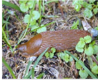
Fig. 2: Arion lusitanicus

2004 was seen only small economic occurrence of native slugs, South European's slugs were not registered.