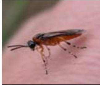
Fig. 5: Adult of Athalia rosae

against this pest is still not solved enough. It is tested lot of preparations, which are effective against adults or larvae. Bionomic investigations in conditions of the Czech Republic are running. Mostly preparations used in plant protection are neonicotinoids as acetamiprid and thiacloprid. Also effect of tissue hardening with nitrofenols is used. In hot years is treated 100% of growing areas, sometimes also two times.