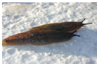
Fig. 1: Native genera slugs

Changes in structure of grown crops, destruction of crop rotations, enlarging of minimalization technologies of growing, expansion of oilseed rape to warmer and dryer lowlands and partly changed climate conditions are main factors, which affect development of pests.